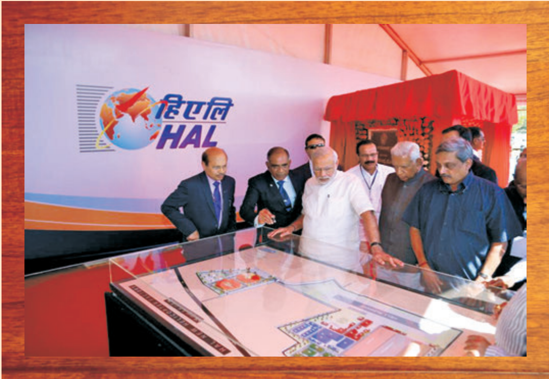
Hon'ble Prime Minister being briefed on new helicopter manufacturing facility at Tumakura.