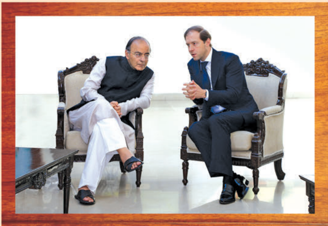
One to one meeting between Mr. Arun Jaitley, Minister for Defence, Finance & Corporate Affairs and Mr. Denis Manturov, Minister of Industry and Trade of the Russian Federation