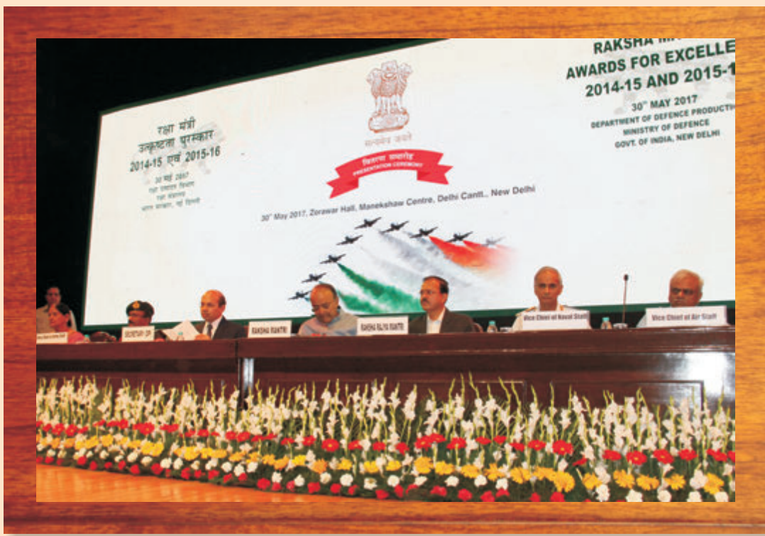
Hon'ble Defence Minister Mr. Arun Jaitley, Minister for Defence, Finance & Corporate Affairs at Raksha Mantri Award for Excellence for the year 2014-15 and 2015-16