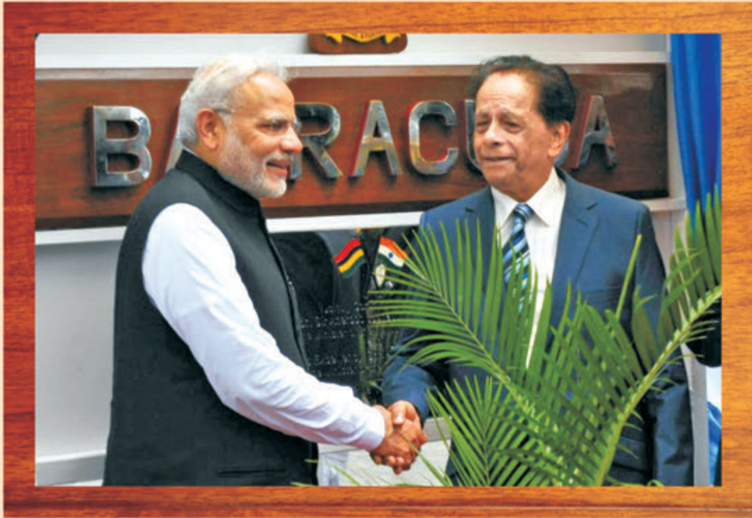
GRSE built OPV, "CGS Barracuda" Commissioned at Mauritius in the presence of Hon'ble Prime Minister of India, Shri Narendra Modi & Hon'ble Prime Minister of Mauritius, Shri Anerood Jugnauth